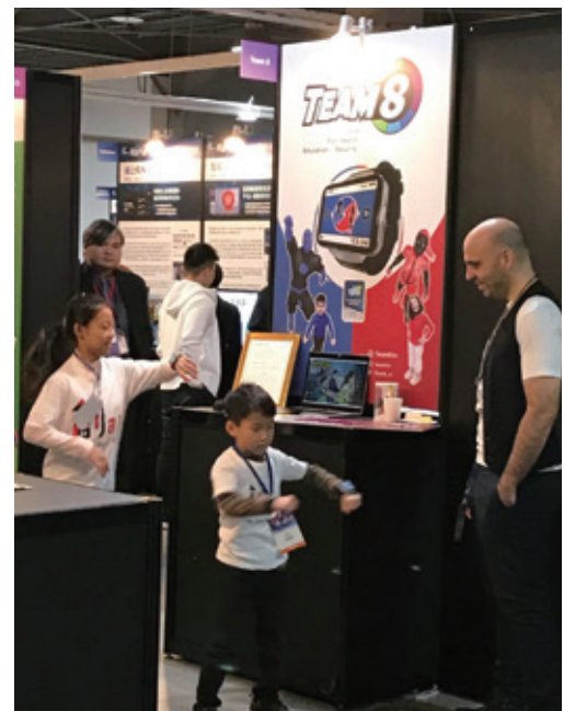
Taiwanese kids playing and exercising while wearing Team8 watch at MobileHeroes Competition

BUT to do all those activities, the heroes need to feed a user's life force; this way the more exercise kids do, the stronger their hero become! It will help parents to control children's weight; the camera inside will be used to collect points, but also to record a kid's food intake and check, in case of allergies, through the barcode, if the product is suitable.