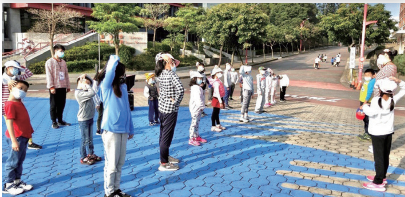
Enjoying sport to the full while preventing COVID-19