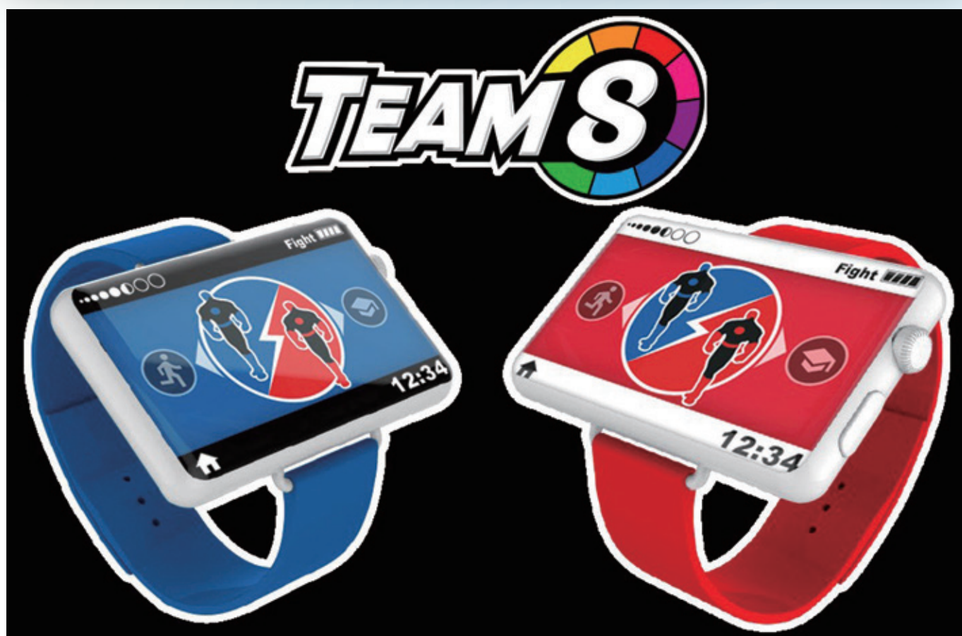
Team8 new 4G device

The HYPE SPIN Accelerator TAIWAN program is a joint effort of the Sports Administration and National Chiao Tung University's IAPS and Israel's HYPE Sports Innovation (HYPE). Starting from October 2018, five training cycles have been held.