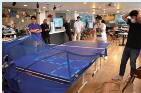
FastPong can be used by beginners to practice and fall in love with table tennis

We are a team with hardware and software solutions for the sports industry. Our first proof of concept was based on table tennis. The product is an Interactive table tennis training board using hardware technologies, data analytics and software. Our patented technology is revolutionizing table tennis on both a professional level and as a recreational sport.