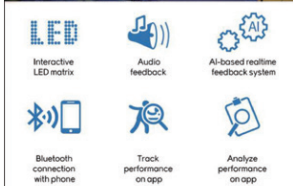
FastPong can also be used by professional table tennis players for training

We have developed a type of hardware which tracks and improves performance for professionals while gamifying the sport for others. As FastPong board provides you with a variety of training, the app collects all your training data to identify your strengths and weaknesses to provide you with the best personalized training program powered by AI.